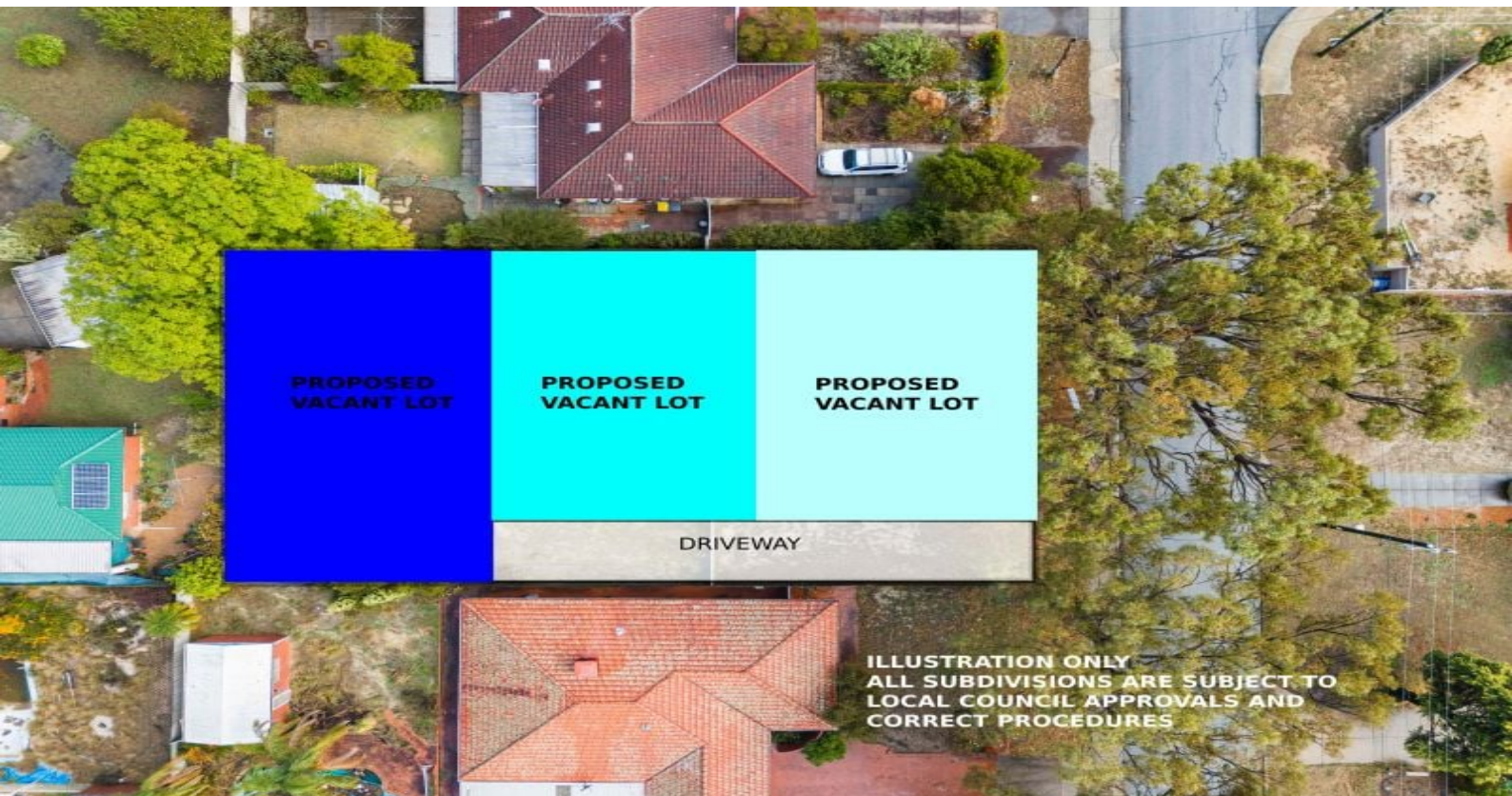
ILLUSTRATION ONLY ALL SUBDIVISIONS ARE SUBJECT TO LOCAL COUNCIL APPROVALS AND CORRECT PROCEDURES